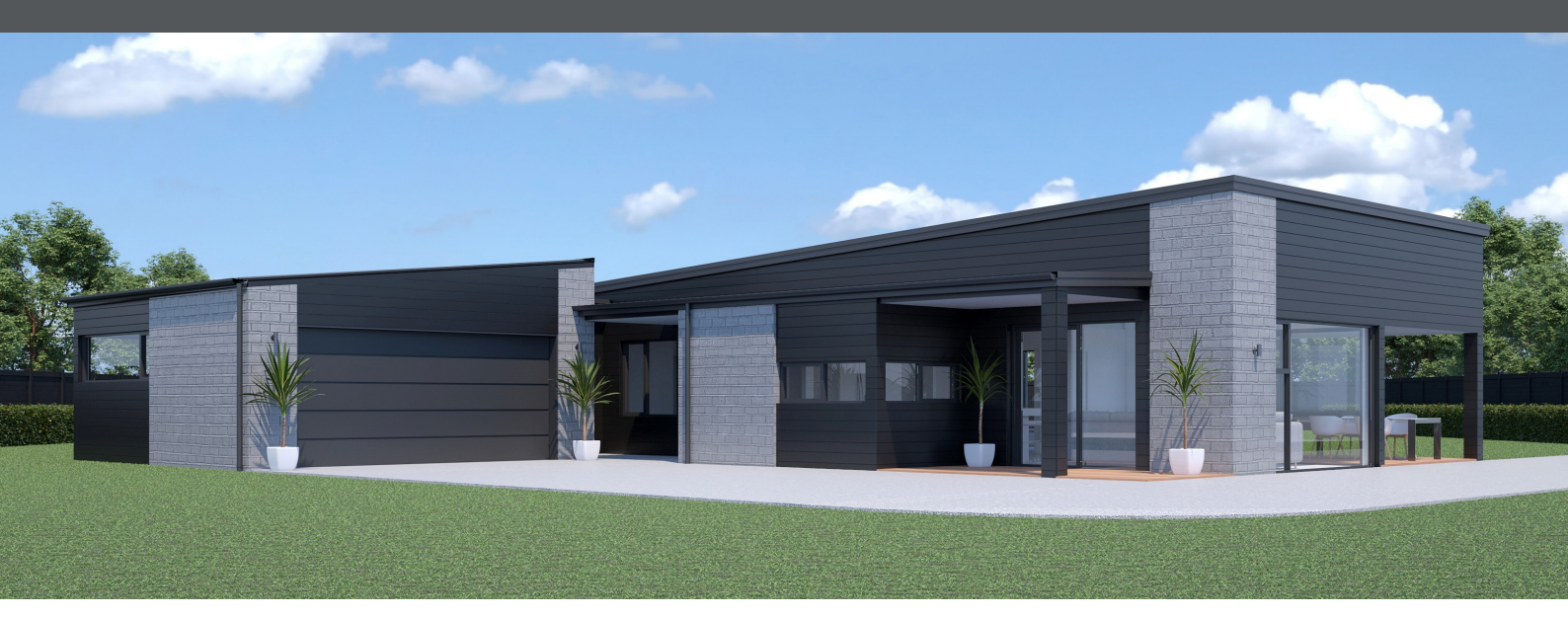
Floor area: 235m <sup>2</sup> | Length: 22.3m | Width: 18.4m (over foundation)